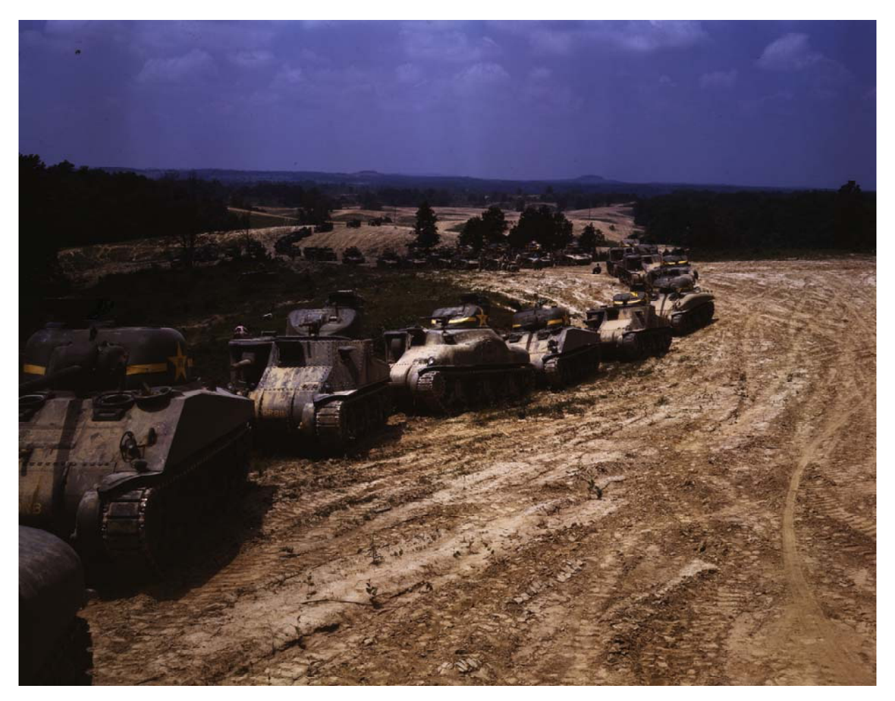
Library of Congress, Prints & Photographs Divisions, FSA/OWI Collection, [LC-DIG-fsac-1a35226]

In the image above, a parade of M-4 Sherman tanks and M-3 Grant tanks are conducting training maneuvers at Ft. Knox, Kentucky. Many of these tanks were constructed at Chrysler War plants.