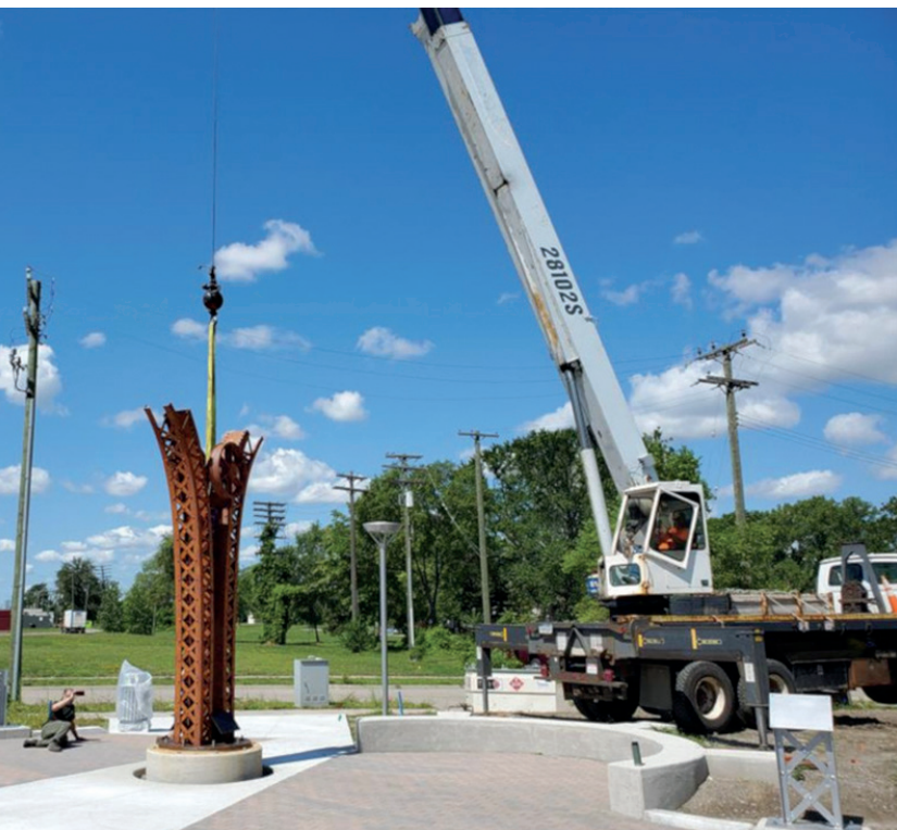
The installation of the March On sculpture Fort Street Bridge Interpretive Park.

Non-Profit Organization U.S. Postage PAID Detroit, MI Permit #1105