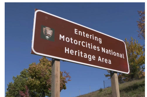
The Highway Sign at I-275, Exit 22 at Michigan Avenue in Canton.

On October 9, 2019, MotorCities Drivers in metro Detroit, as well as in Monroe County and near Ypsilanti, got their first glimpse of MotorCities' new highway signs in the Spring of 2020. Through our continued collaboration with the Michigan Department of Transportation, five additional signs were installed to join the original nine signs installed in November and December 2019.