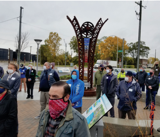
Onlookers at the ceremony with the March On sculpture in the background.

On October 22, 2020 MotorCities and a group of community partners known as the Fort-Rouge Gateway Coalition (FRoG), along with government officials, the Friends of the Rouge (FOTR) and funders, cut the ribbon and opened the new Fort Street Bridge Interpretive Park, located at the foot of the Fort Street Bridge in southwest Detroit.