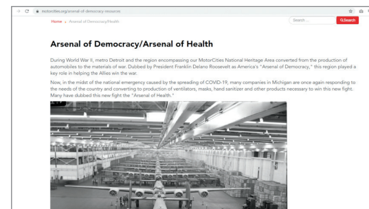
MotorCities' Arsenal of Democracy/Health webpage.

In the Spring, MotorCities paid tribute to our auto industry who, in the midst of the national emergency caused by COVID-19, responded to the needs of the country and converted to production of ventilators, masks, hand sanitizer and other products necessary to win this fight. Like the Arsenal of Democracy years during World War II, many have dubbed our region during this time as the "Arsenal of Health."