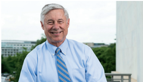
U.S. Congressman Fred Upton

Heritage Day, presented virtually for the first time due to the pandemic and combined with the organization's Annual Meeting. The awards recognize organizations or individuals who have delivered outstanding projects in the areas of auto or labor heritage tourism, education/interpretation and revitalization.