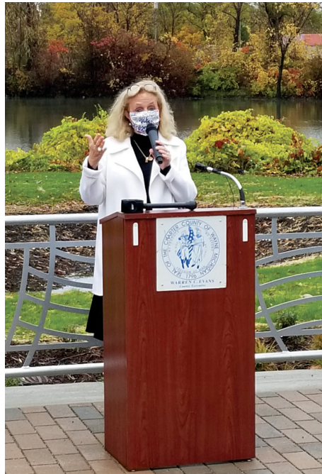
Congresswoman Debbie Dingell

The park links to major greenway arteries like the Iron Bell Trail, Down-river Linked Greenways - with plans to connect to the Rouge Gateway Trail and to the Lower Rouge River Water Trail. It also holds true to the visionary leadership of the late U-M Dearborn